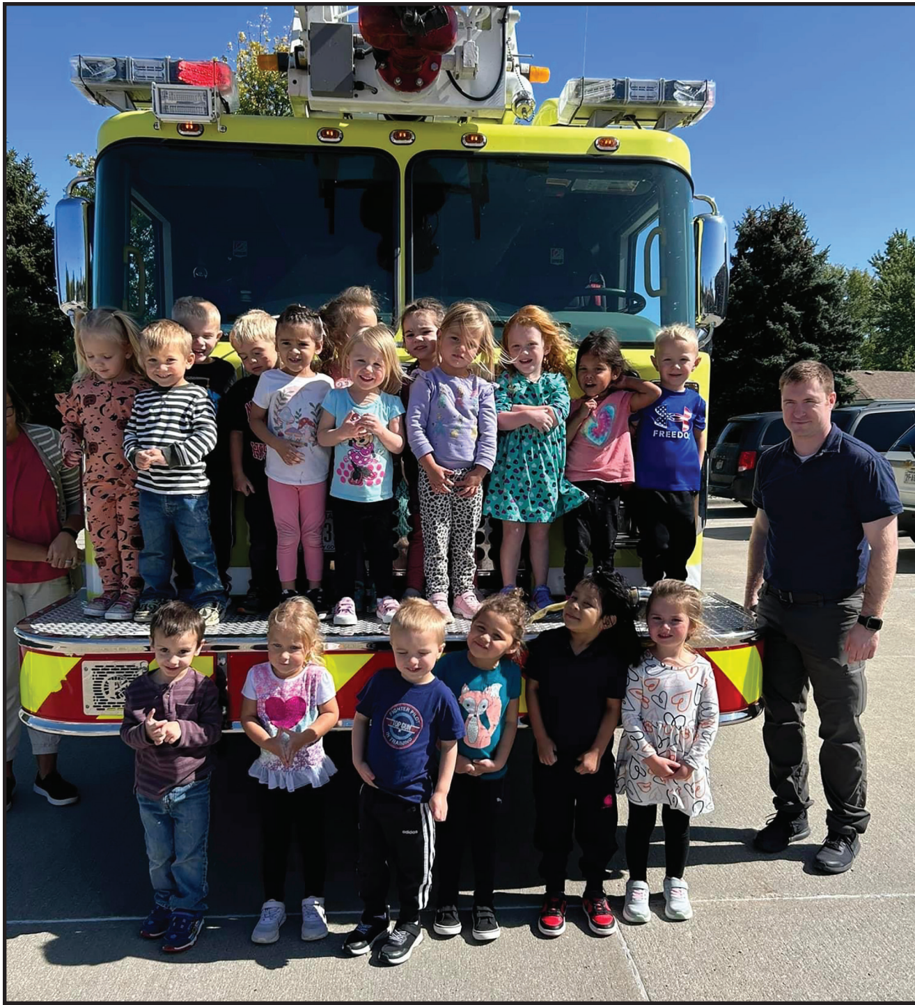
The students at the ELC got to see a fire truck and fire equipment up close during Fire Prevention Week.