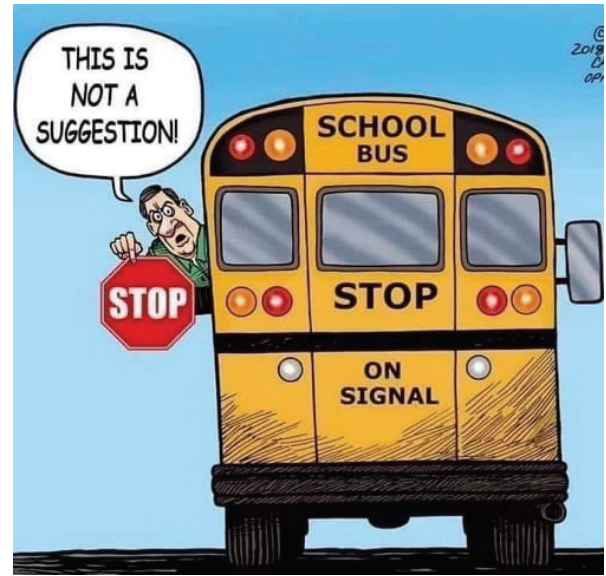
Please be mindful of ALL the buses carrying our students!!