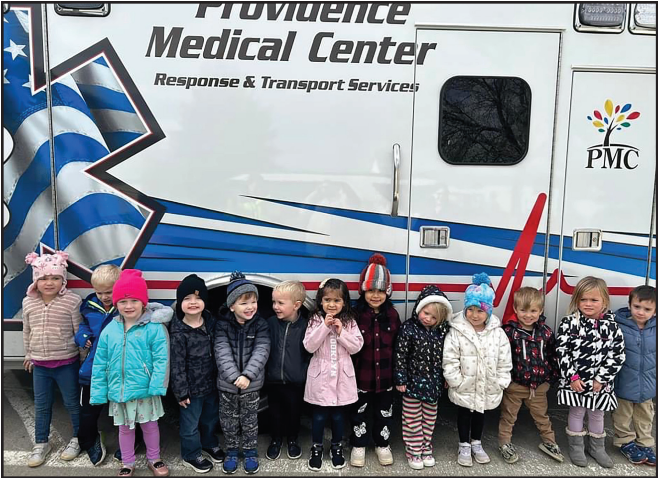
Thank you to Providence Medical Center for bringing down an ambulance for the Early Learning Center to check out.